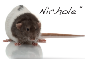
Nichole "Mama" Krause 2011 President "Year of the Rat!"

The haunted house is off to a WONDERFUL start! We are planning on moving the rest of the items back to the location on Sept. 13th at 6 pm. If you are available please come as all we have left is the lumber and that is going to require as many people as possible. It is my hope to have a finalized layout by then so we can start laying out lumber that night or possibly later that week/weekend. I'm hoping to put together a plan of attack that night as well on when we want to work on the construction/decorating throughout the month of September and early October but I need your input! This is very much a team project and designing a plan of attack